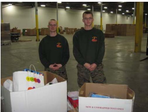
Marines at the Toys for Tots warehouse with the boxes of toys collected at Lehman's.

Once again, Lehman's Garage collected new toys for the U.S. Marine Corps Reserve Toys for Tots Program. We collected many toys at all six locations which were distributed at Christmas to local children in need.