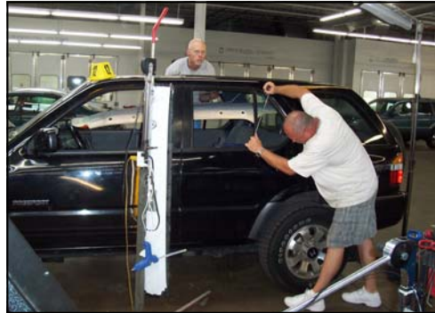
The Paintless Dent Removal Process

Lehman's is excited to now offer PDR services in house to its customers. This acquisition further establishes Lehman's as a full service auto repair facility.