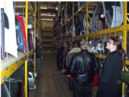
CE Class takes a tour of AAA Auto Salvage in Rosemount