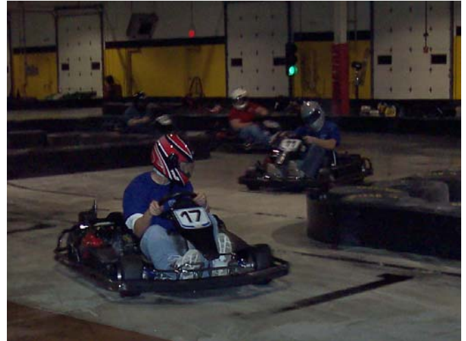
AASP Race for Automotive Education