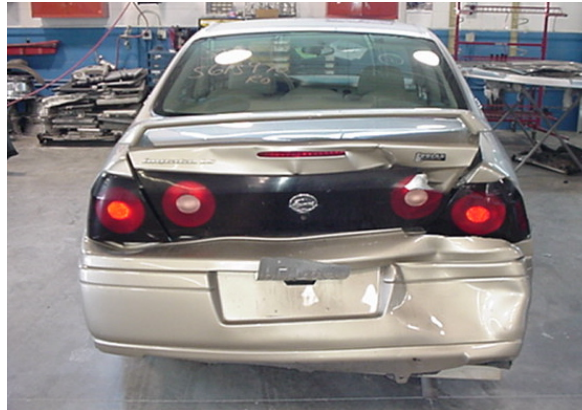
2004 Chevrolet Impala before repair work begins

This is a great opportunity for all involved, especially the HTC students who receive hands on experience while doing something good for the community. Once completed, the vehicle will be donated to an organization that provides cars to families in need.