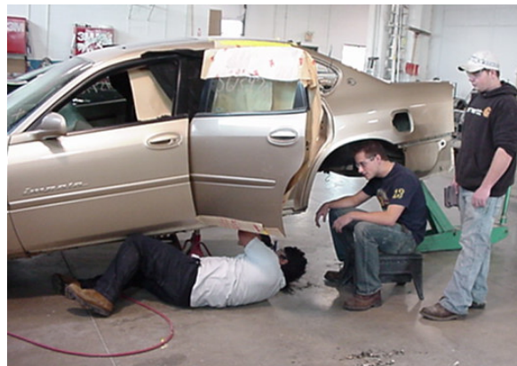
HTC students working on the vehicle