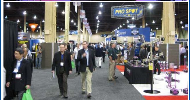
Top: Captain Chesley "Sully" Sullenberger, pilot who heroically landed US Airways Flight 1549 in the Hudson River, speaks at the Opening General Session; Jeff Gordon; the exhibitor floor.